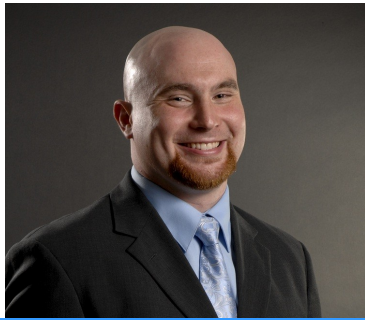
UIM/UM coverage and why its vital.